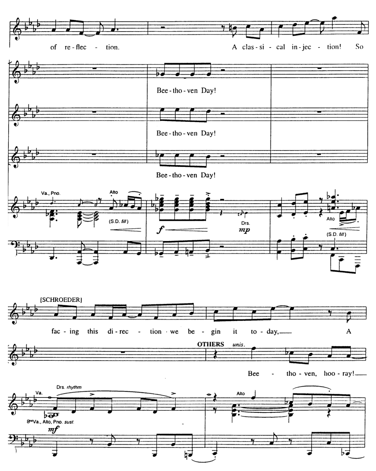
CBR - Piano Conductor